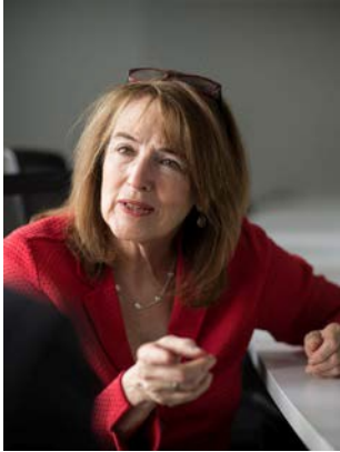
Honorable Nancy Gertner Judge, US District of Massachusetts. (Ret). Senior Lecturer, Harvard Law School

Nancy Gertner is a former U.S. federal judge who built her career around standing up for women's rights, civil liberties and justice for all. She has been named one of "The Most Influential Lawyers of the Past 25 Years" by Massachusetts Lawyers Weekly. Gertner has published widely on sentencing, discrimination, and forensic evidence; women's rights; and the jury system. Her autobiography, "In Defense of Women: Memoirs of an Unrepentant Advocate," was published in 2011. Gertner has received countless awards, including the ABA's Thurgood Marshall Award, which recognizes outstanding contributions in the legal profession to the advancement of civil rights and civil liberties in the United States.